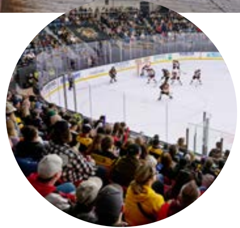
Fans watching a Brantford Bulldogs OHL game

Complement your event schedule with an activity to build and strengthen attendee relationships by taking advantage of Brantford's exceptional cultural, historical and outdoor adventures.