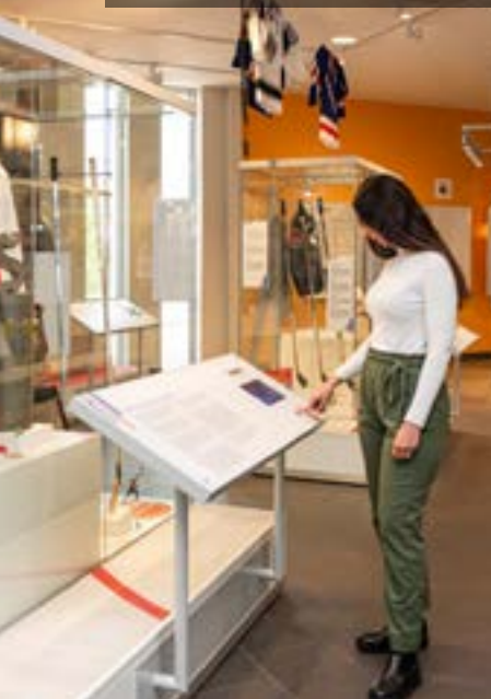
Glenhyrst Art Gallery of Brant