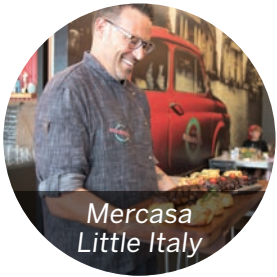
Mercasa Little Italy