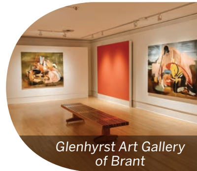
Glenhyrst Art Gallery of Brant