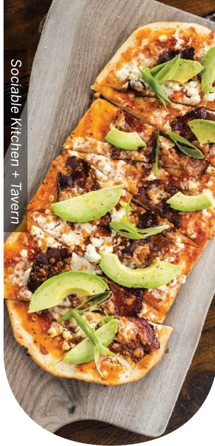
Sociable Kitchen + Tavern