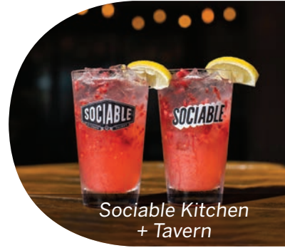
Sociable Kitchen + Tavern