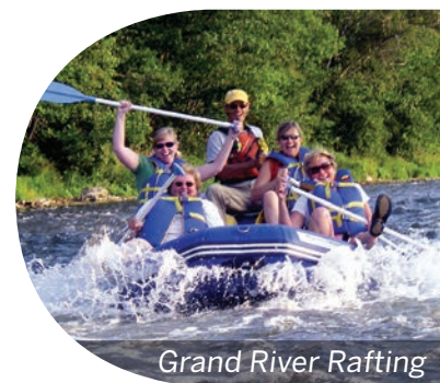
Grand River Rafting