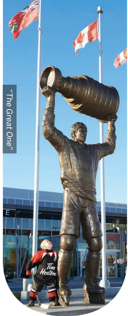
"The Great One"