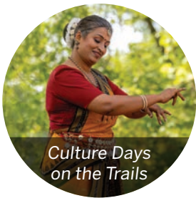
Culture Days on the Trails