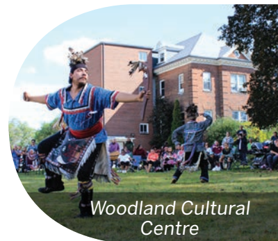
Woodland Cultural Centre