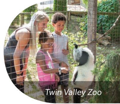
Twin Valley Zoo