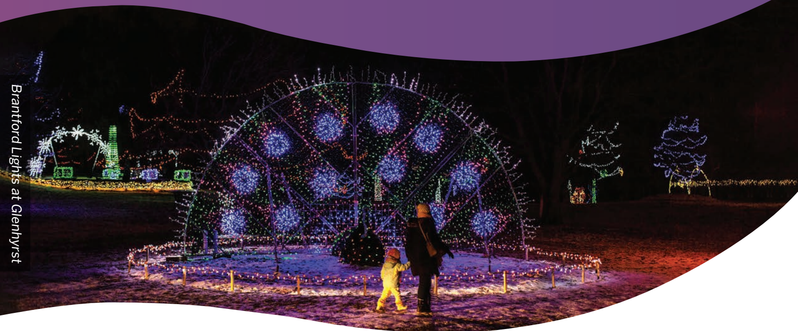
Brantford Lights at Glenhyrst

Brantford hosts numerous annual events, so it's easy to find a reason to celebrate in every season. Plan a visit during one of these exciting events.