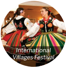
International Villages Festival