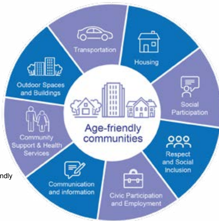
Figure 2. WHO Age-Friendly Dimensions